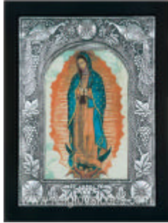
"Our Lady of Guadalupe, our mother and patroness of the unborn, pray for us."