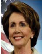
Congresswoman Nancy Pelosi

San Francisco, California - 8th District